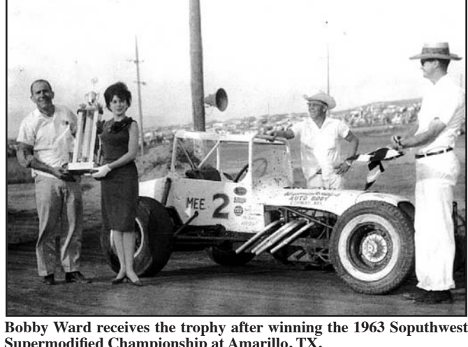
Supermodified Championship at Amarillo, TX.

"On my sixth birthday I had asked my mom for some type of